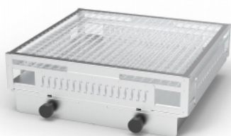
Universal spring clip