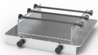
Rod-Clamp Shaking Plate